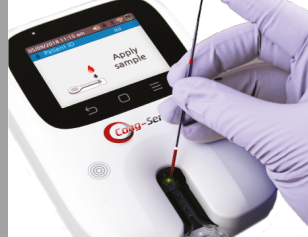
Step 3 Dispense sample onto test strip