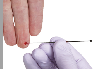
Step 2 Lance finger and collect a bead of blood with in- cluded transfer tube