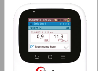
Step 4 Wait for results (testing time is the patient's actual clotting time)