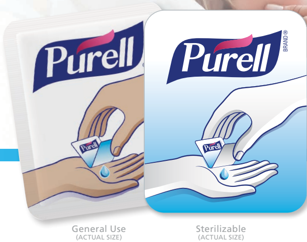
General Use (ACTUAL SIZE)